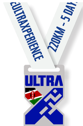
White Ribbon Under 31 hours