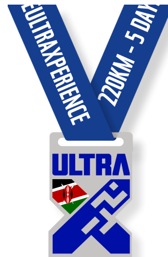
Blue Ribbon Over 31 hours