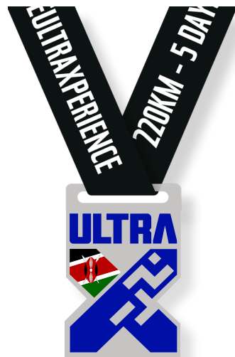
Black Ribbon Under 26 hours

As part of our Sustainability Policy , the Green Ribbon will be awarded to the competitor that displays the highest commitment to reducing their environmental impact both in preparation for and during the race (as determined by the organisers).