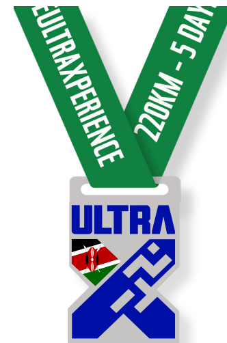
Green Ribbon Environmental award