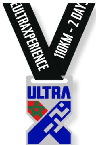
Black Ribbon Under 10 hours

As part of our Sustainability Policy , the Green Ribbon will be awarded to the competitor that displays the highest commitment to reducing their environmental impact both in preparation for and during the race (as determined by the organisers).