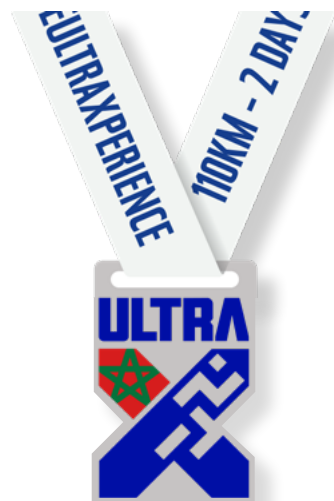
White Ribbon Under 12 hours