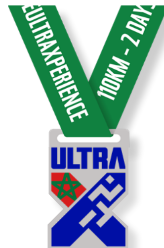
Green Ribbon Environmental award