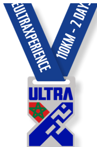
Blue Ribbon Over 12 hours