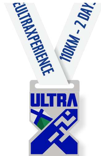
White Ribbon Under 14 hours 30 mins