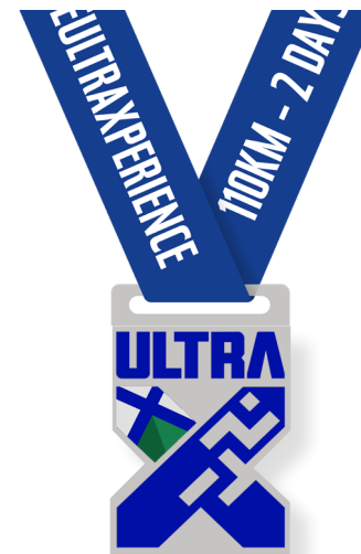
Blue Ribbon Over 14 hours 30 mins