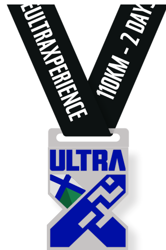
Black Ribbon Under 12 hours 30 mins

For the 110km multi-stage race different medal ribbons will be awarded based upon the finishing times outlined below.